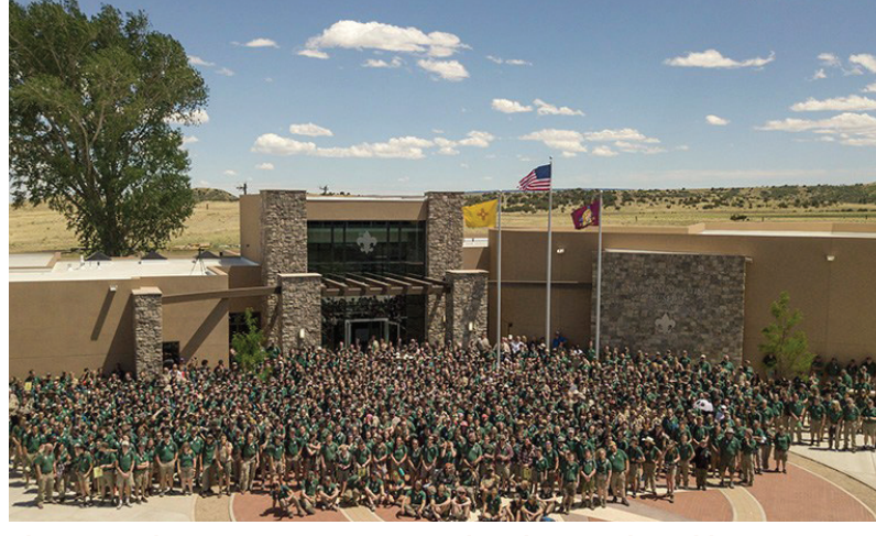
The National Scouting Museum opened its doors to the public in May 2018. Pictured are the 2018 Philmont summer seasonal staff in front of the completed facility.

The National Scouting Museum's Philmont home will be the primary place to see Scouting memorabilia, but the BSA's expansive collection of Scouting collectibles will be spread far and wide. Additionally,